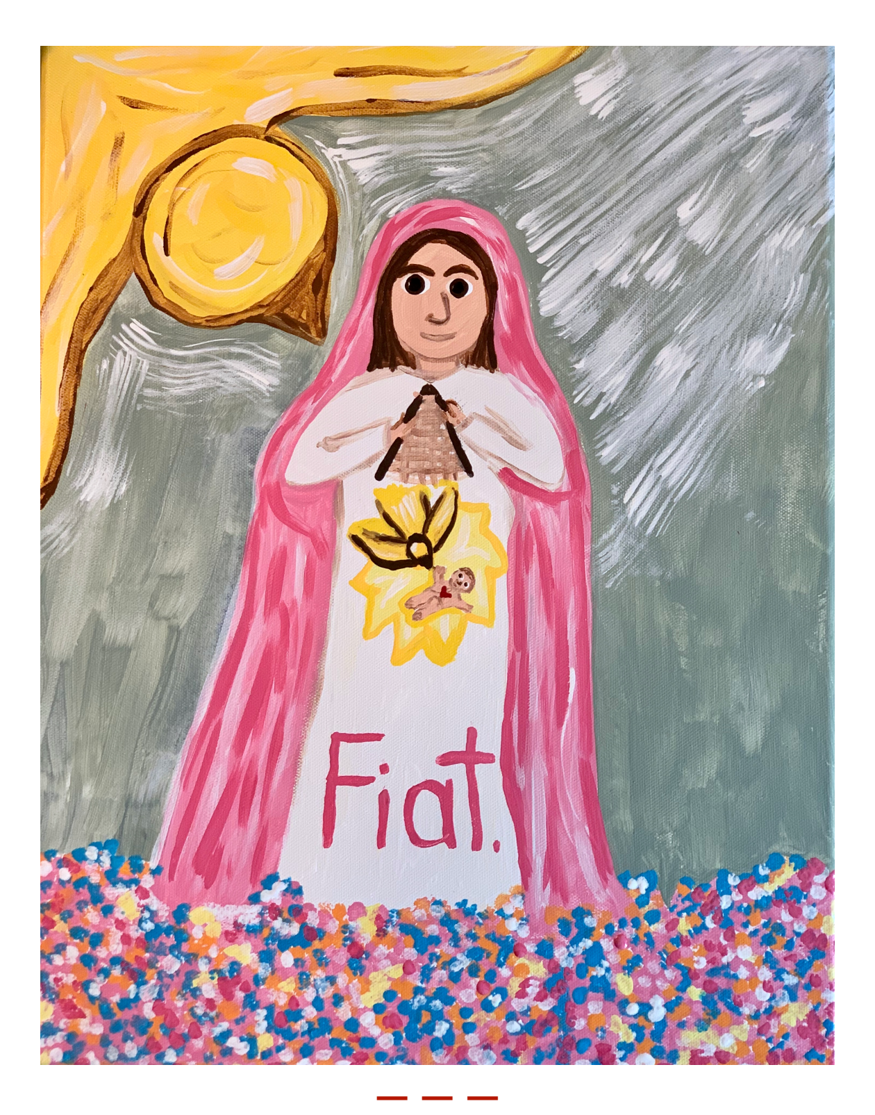
Our Lady, Knitting as the Holy Spirit knits Jesus together in Her womb because of Her Fiat.