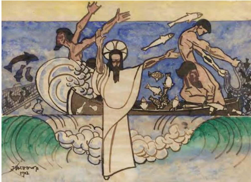
The Miraculous Catch of Fish; Jan Toorop, 1912, Netherlands