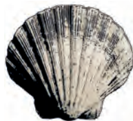
The Sea Shell

Some say that St. Augustine had been talking with an angel sent by God to teach him a lesson on intellectual pride. Others say it was the Christ Child Himself who came to remind Augustine of the limits of human understanding in relation to the great mysteries of our Faith.