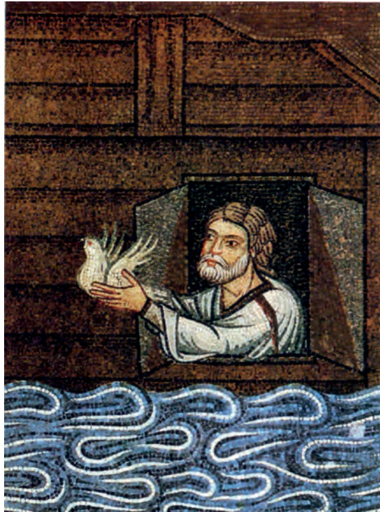
Mosaic in the Basilica of Saint Mark, Venice

The participants of Vincent's retreats were as various as the fishes of the waters. These people represent the Communion of the Church: young and old, scholar and illiterate, rich and poor, elite and outcasts, clergy and the laity, et cetera.