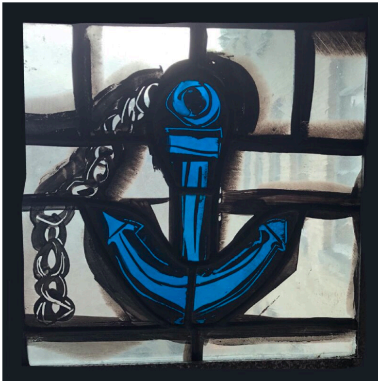
Stained glass in Mater Christi Chapel, Astoria NY

In the midst of this storm I cast my anchor toward the throne of God, the anchor that is the lively home in my heart. (Saint Paul Le-Bao-Tinh, Vietnamese Martyrs)