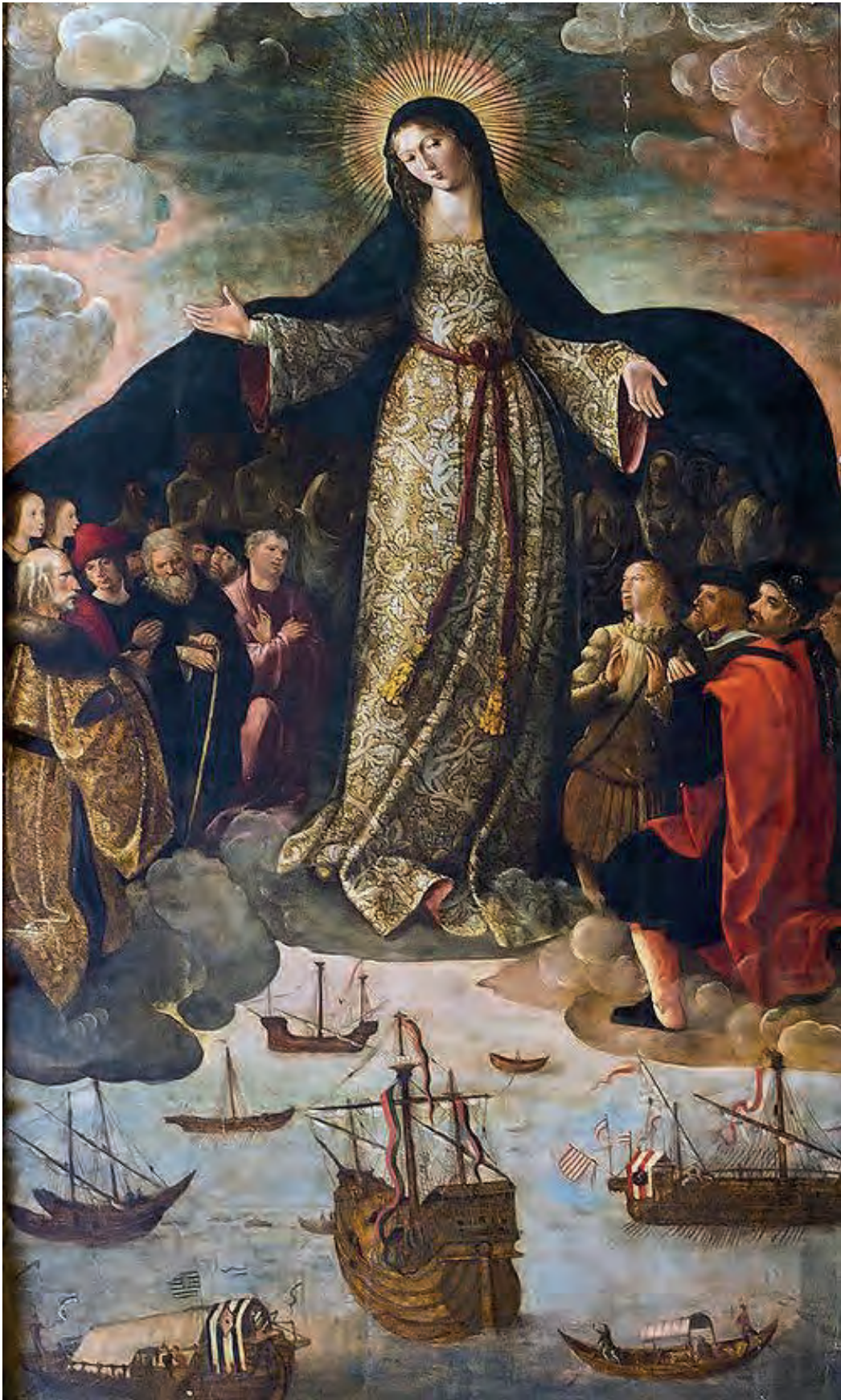
La Virgen de los Navegantes