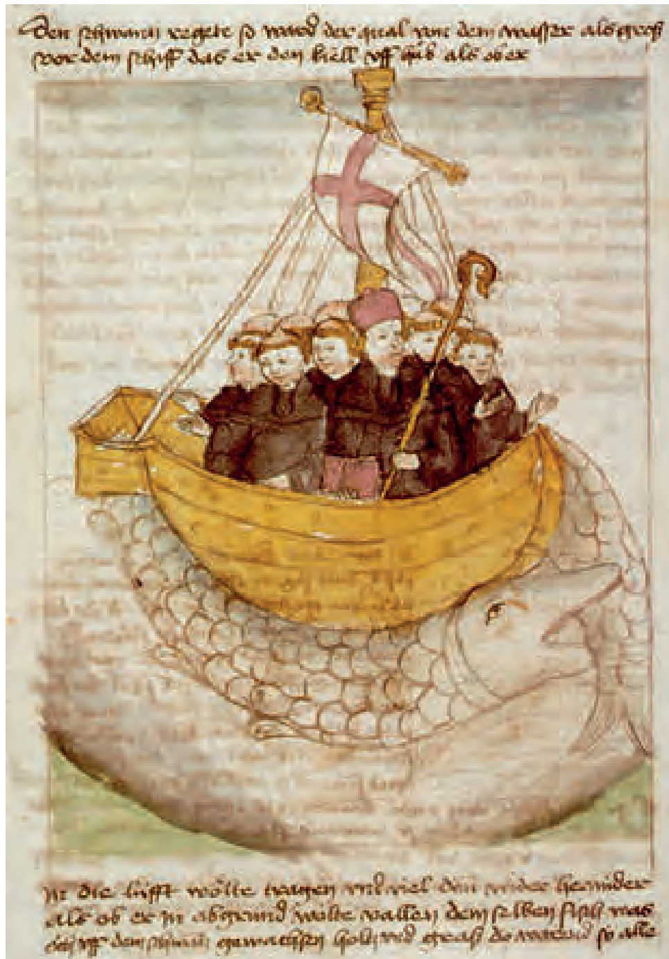
"Saint Brendan and the Whale" from a 15th-century manuscript.