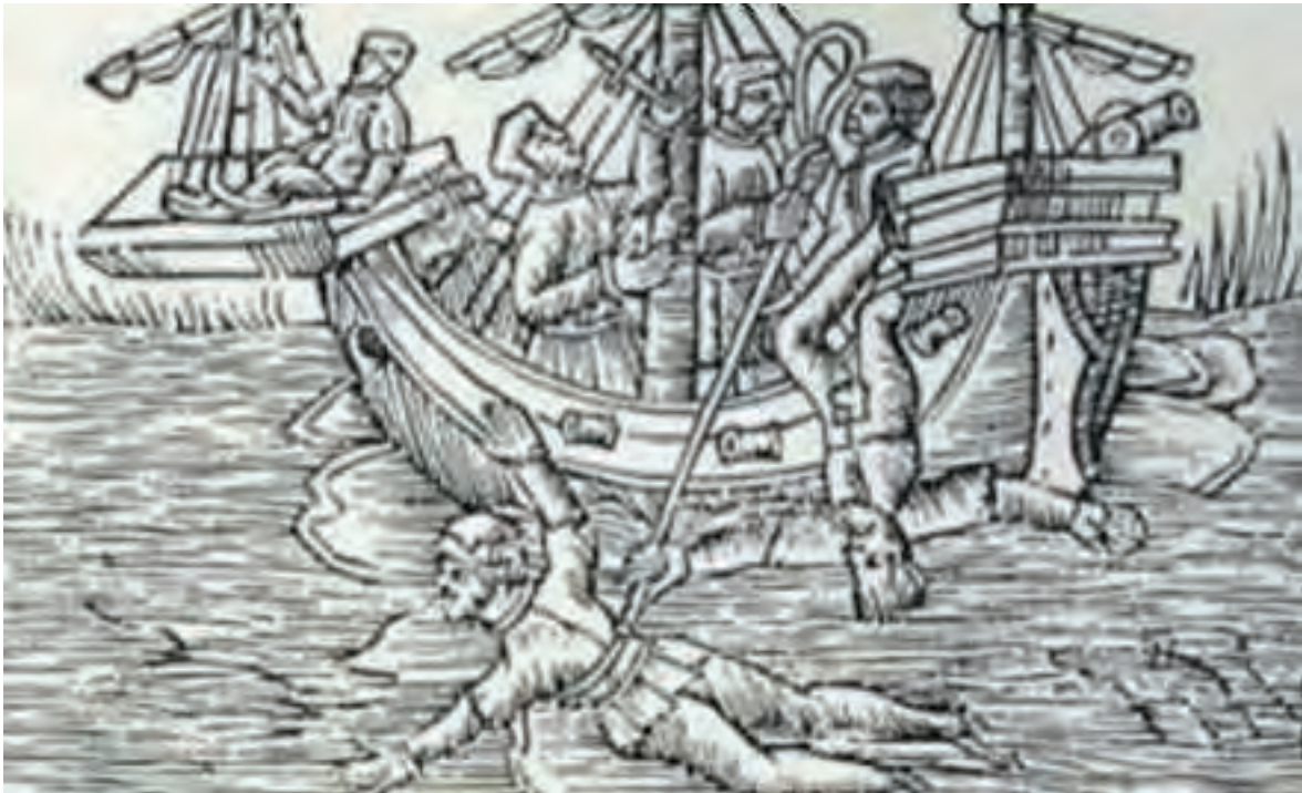
Woodcut illustrating keelhauling, from the Tudor period (1485–1603)

It was or was not true, that someone said, that if a person wrote anything, then they'd find a reason to be keelhauling, walking the plank, be hanging, flogging, whipping with the cat o' nine tails, ouch et cetera!