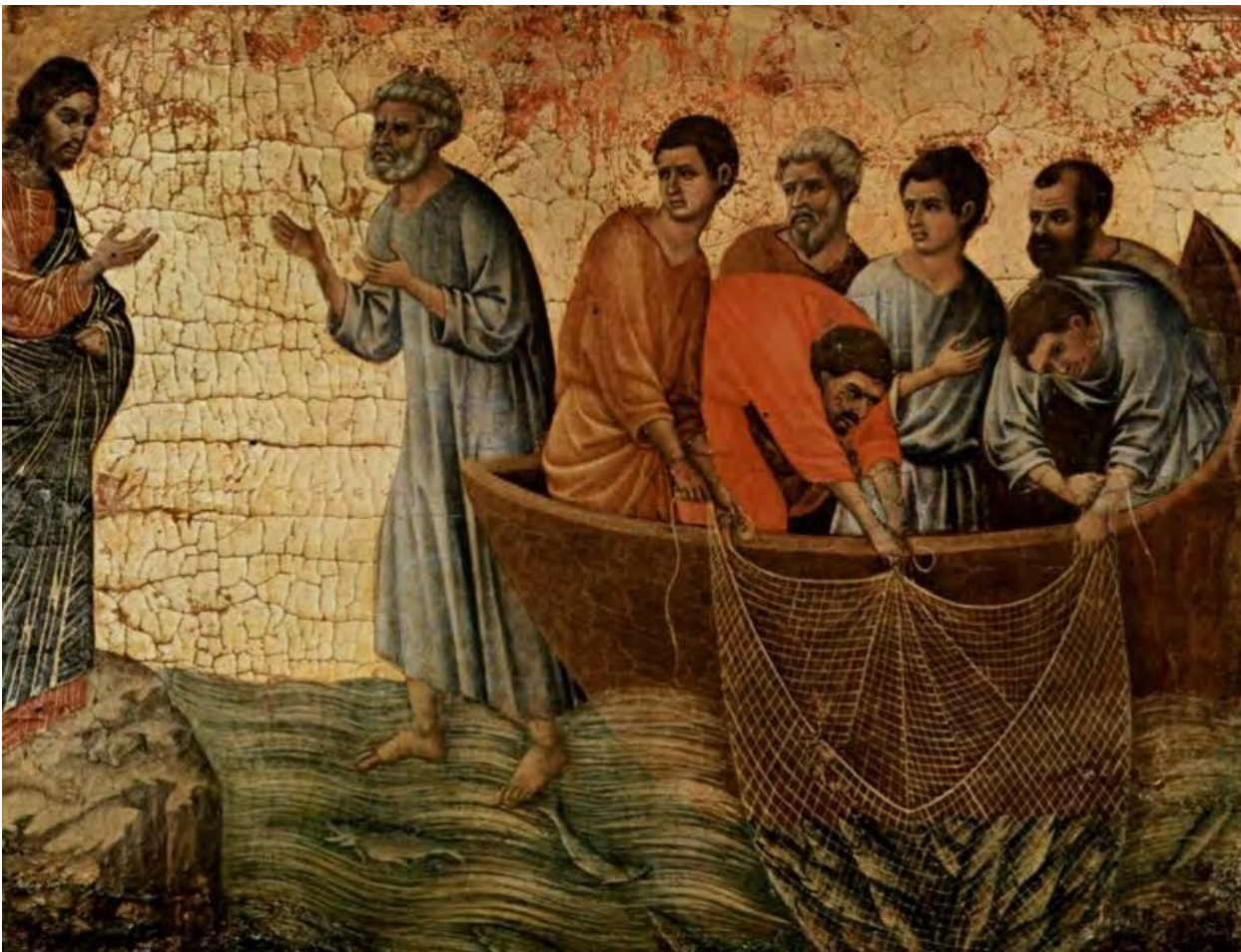
The Call of the Apostles, Fishers of Men; Duccio di Buoninsegna

“So Simon Peter went aboard and hauled the net ashore, full of large fish, a hundred fifty-three of them; and though there were so many the net was not torn” (John 21:11).