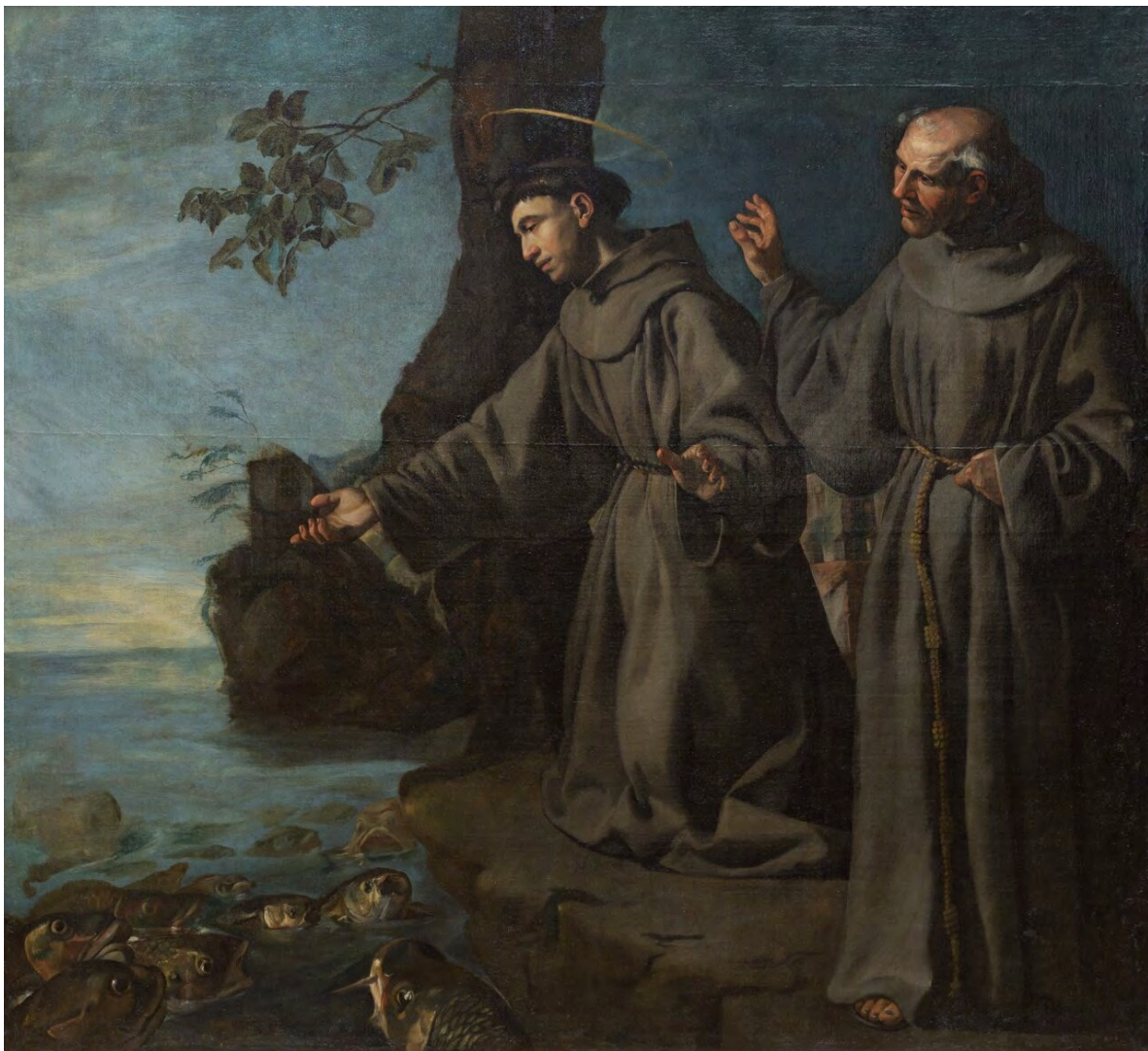
Saint Anthony Preaching to the Fishes , ca. 1630, attributed to Francisco de Herrera the Elder

[I Fioretti of Saint Francis of Assisi, chapter 40]