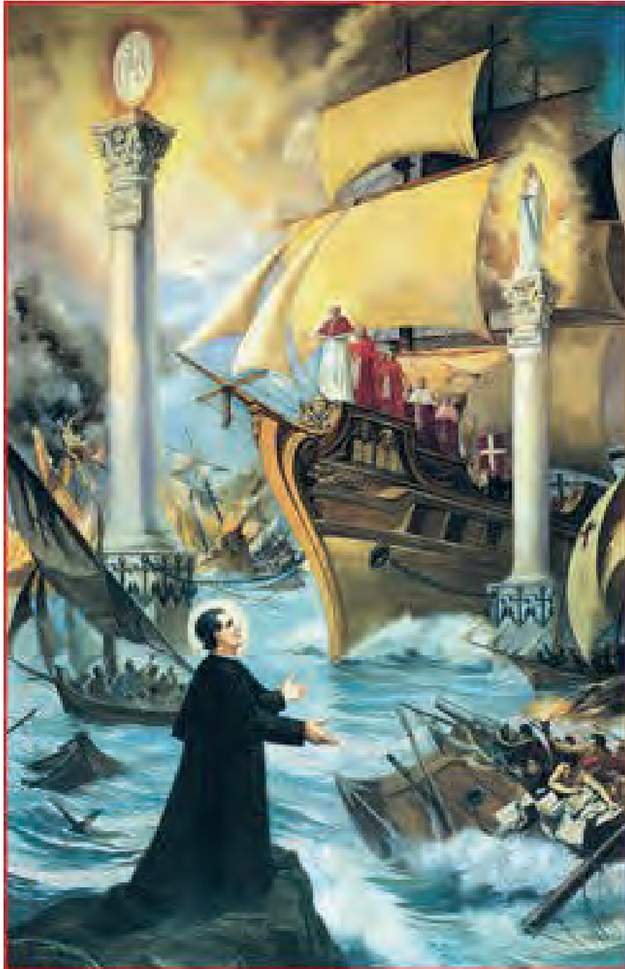
Saint John Bosco's Vision of Two Pillars: Holy Eucharist and Our Lady