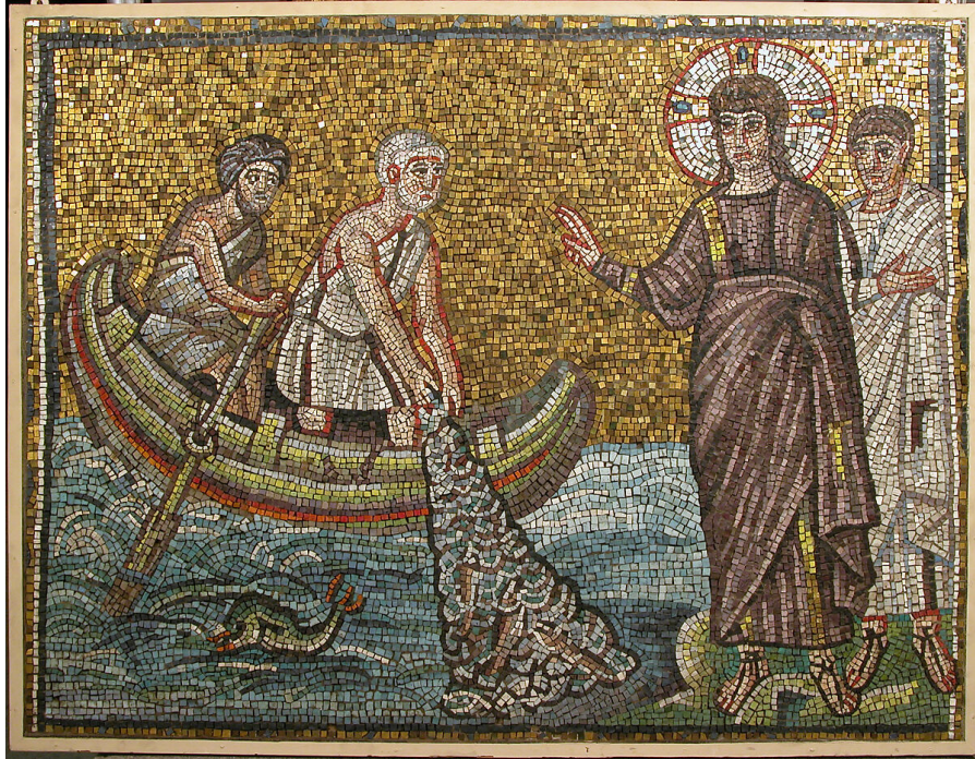
The Miraculous Draught of Fishes; Byzantine

Come after me, and I will make you fishers of men (Mark 1:17).