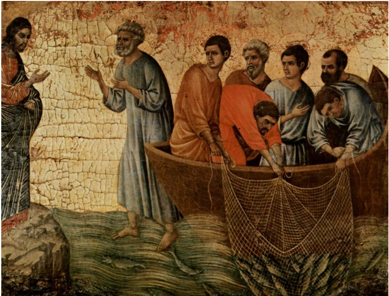
The Call of the Apostles, Fishers of Men

“So Simon Peter went aboard and hauled the net ashore, full of large fish, a hundred fifty-three of them; and though there were so many the net was not torn” (John 21:11).