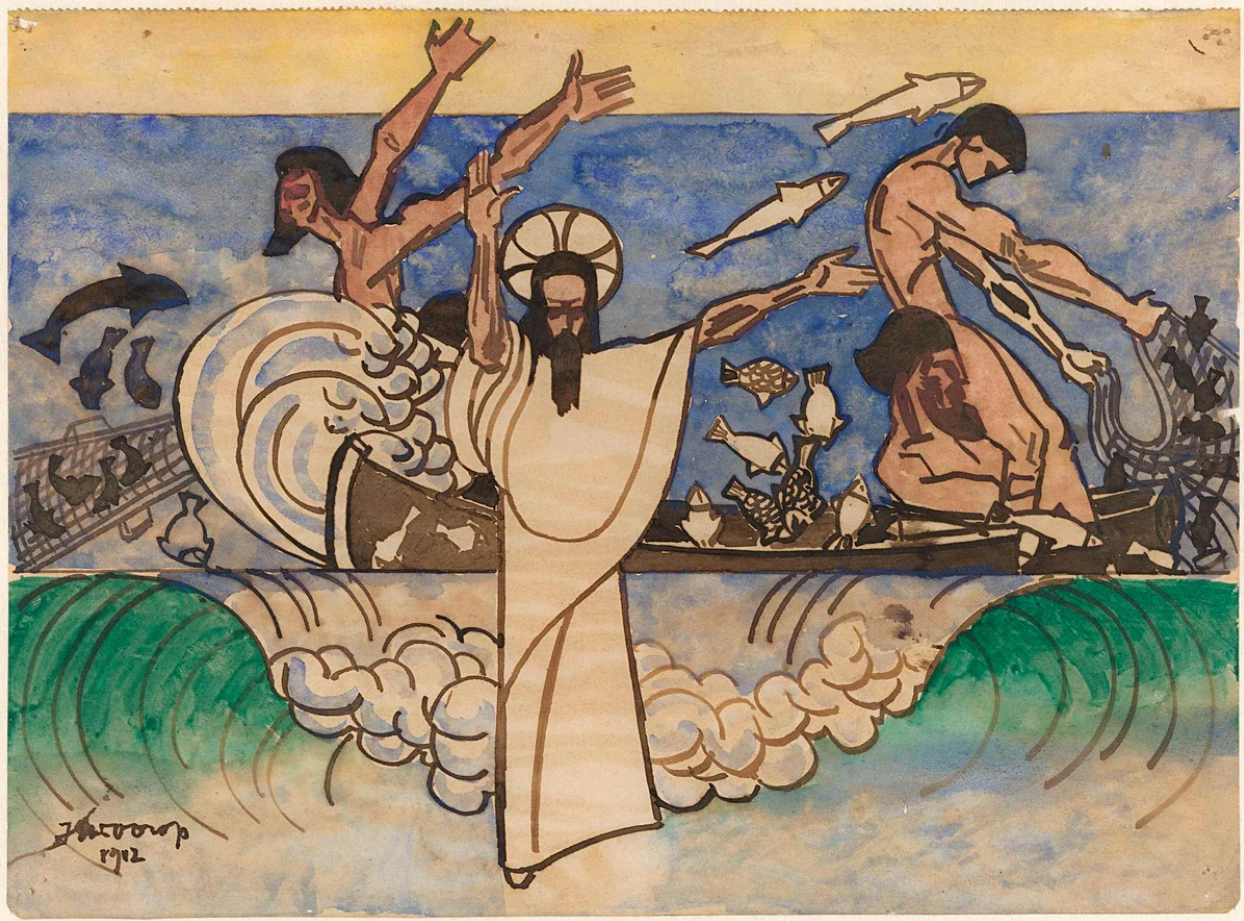
The Miraculous Catch of Fish - Jan Toorop