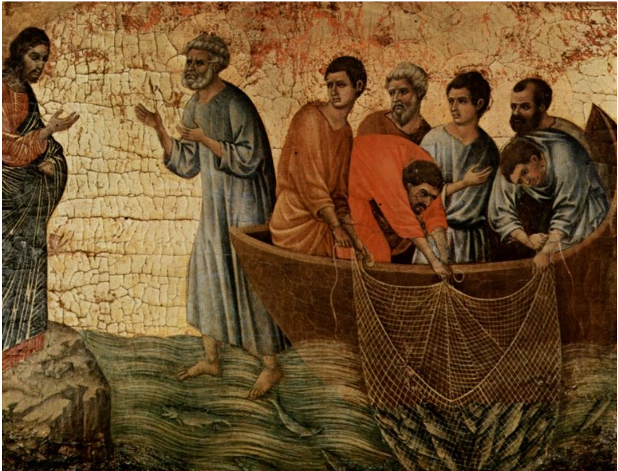
The Call of the Apostles, Fishers of Men

“So Simon Peter went aboard and hauled the net ashore, full of large fish, a hundred fifty-three of them; and though there were so many the net was not torn” (John 21:11).