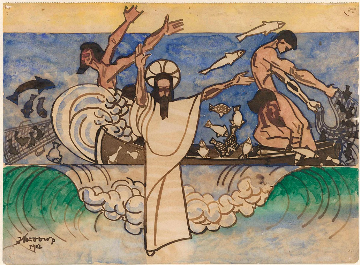
The Miraculous Catch of Fish - Jan Toorop