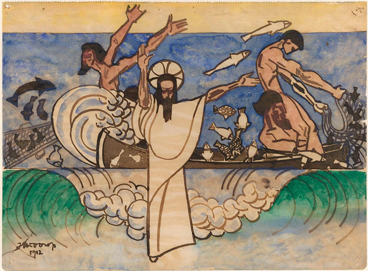
The Miraculous Catch of Fish - Jan Toorop