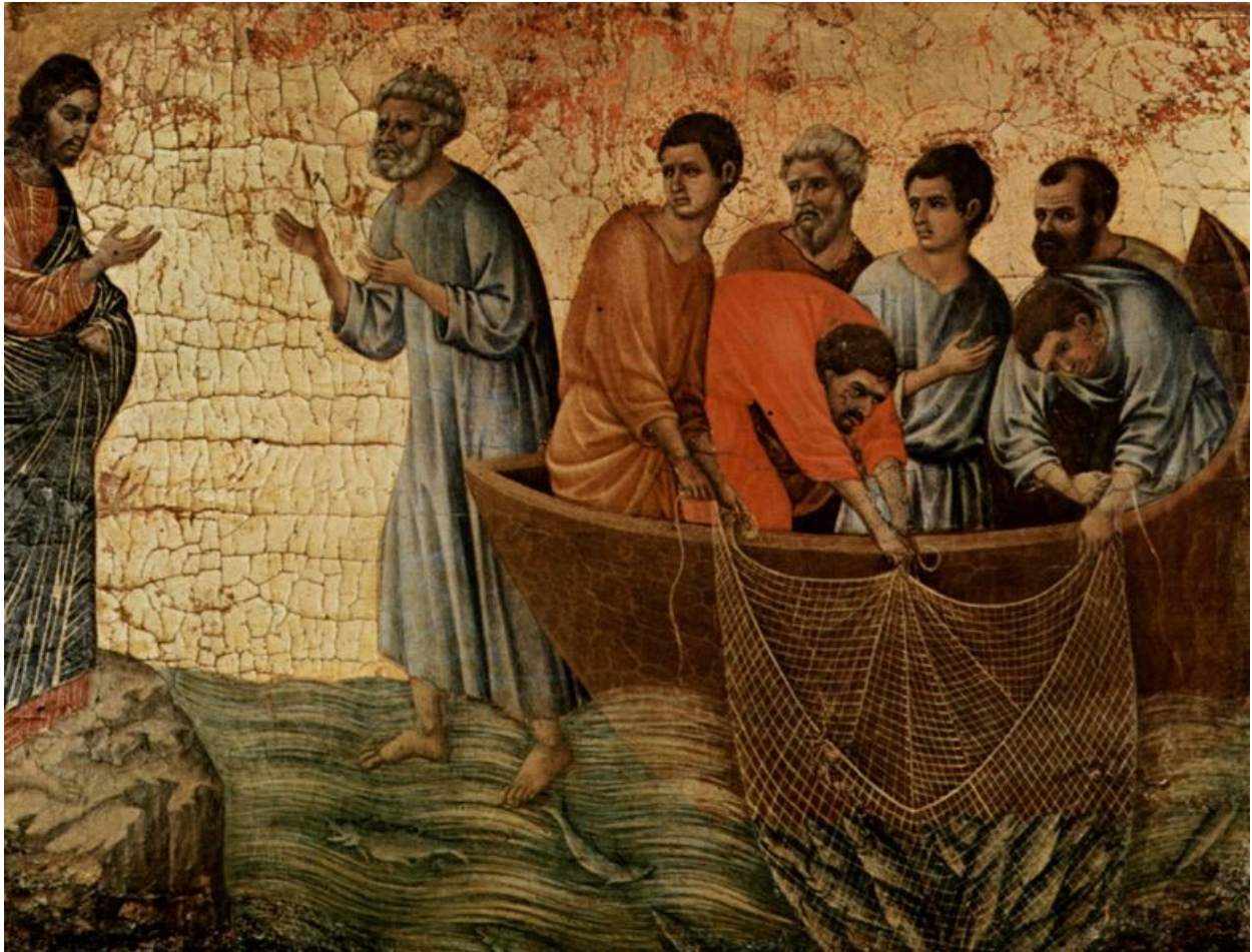
The Call of the Apostles, Fishers of Men

“So Simon Peter went aboard and hauled the net ashore, full of large fish, a hundred fifty-three of them; and though there were so many the net was not torn” (John 21:11).