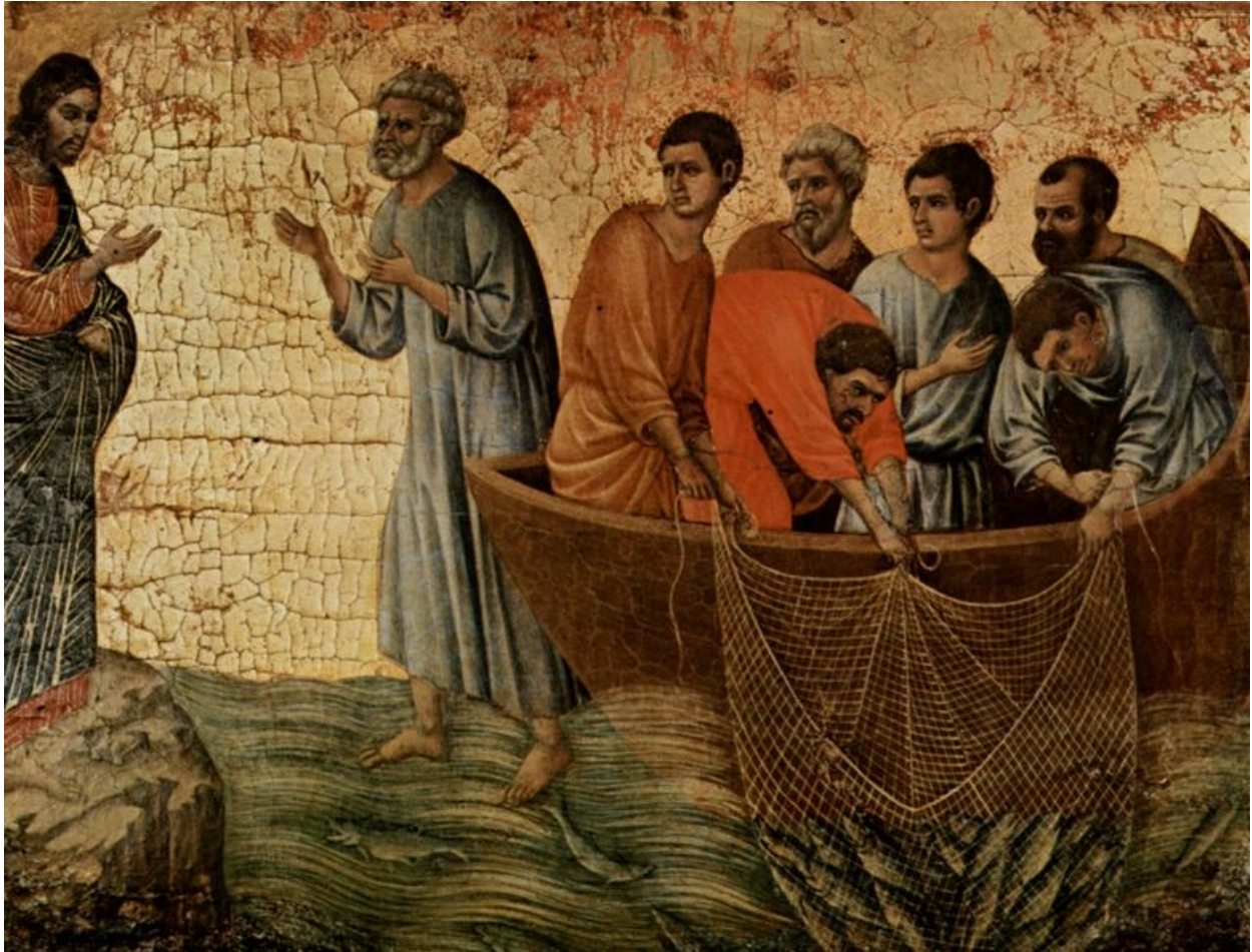
The Call of the Apostles, Fishers of Men

“So Simon Peter went aboard and hauled the net ashore, full of large fish, a hundred fifty-three of them; and though there were so many the net was not torn” (John 21:11).