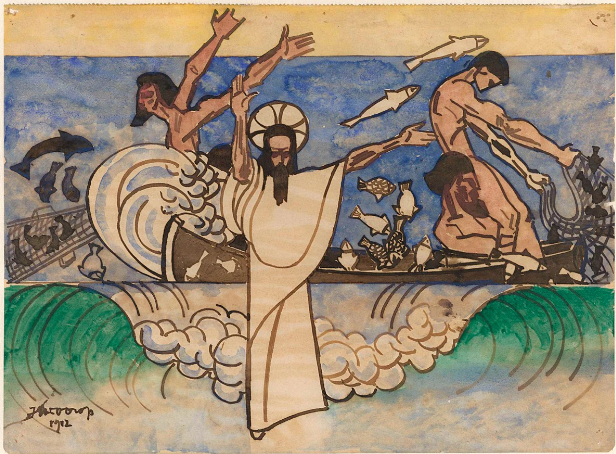
The Miraculous Catch of Fish - Jan Toorop